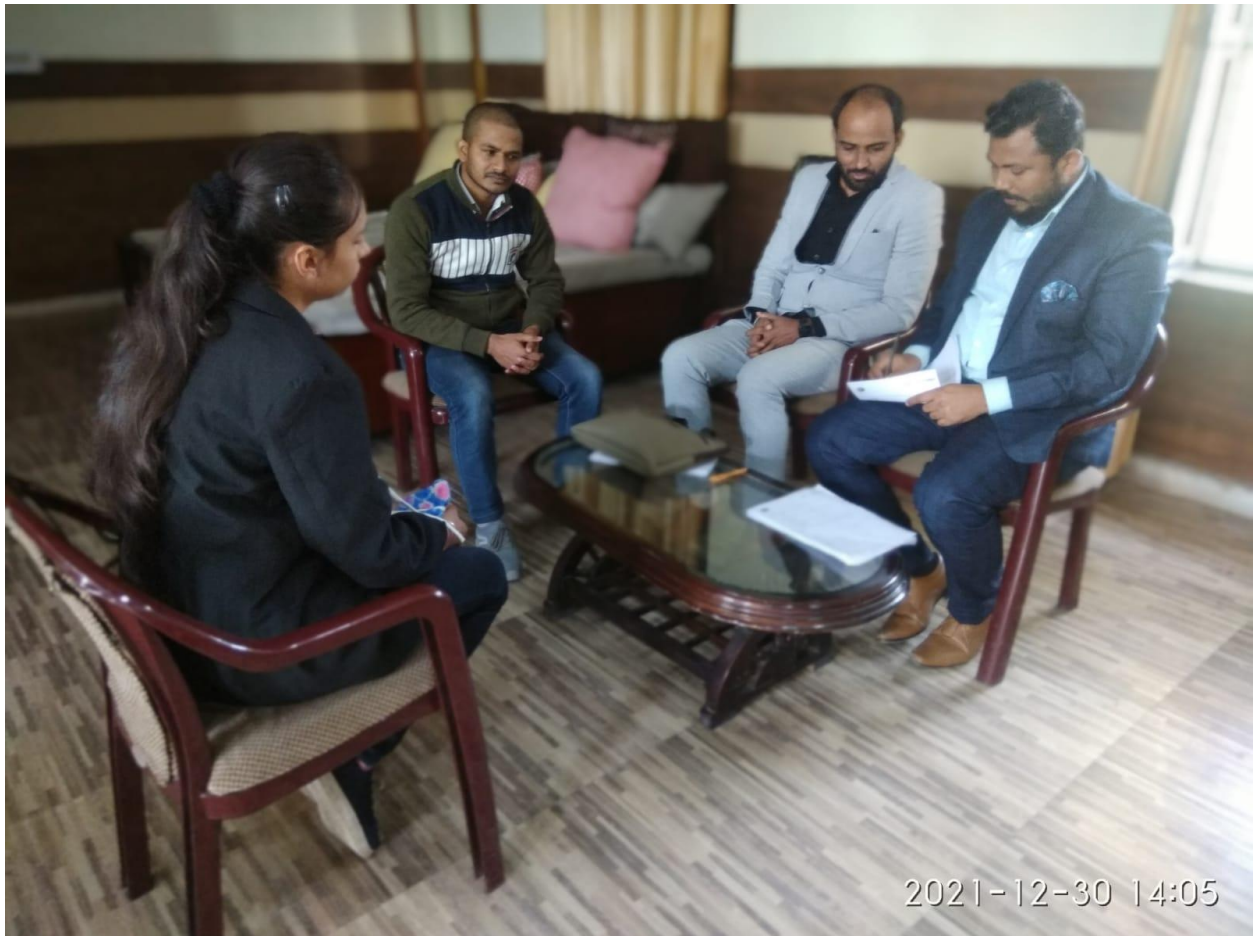
Screening Test Going on