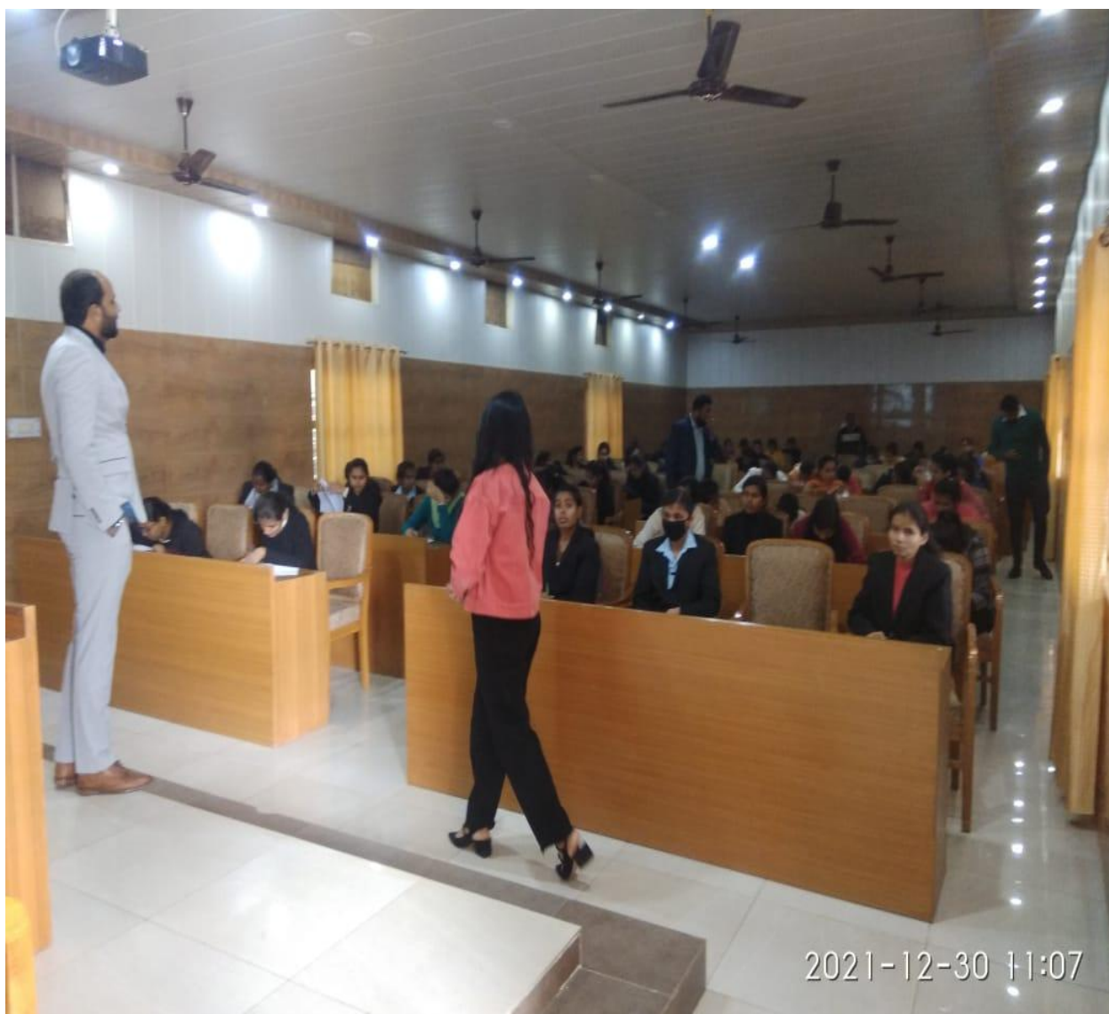
Expert Briefing Students Before the Drive