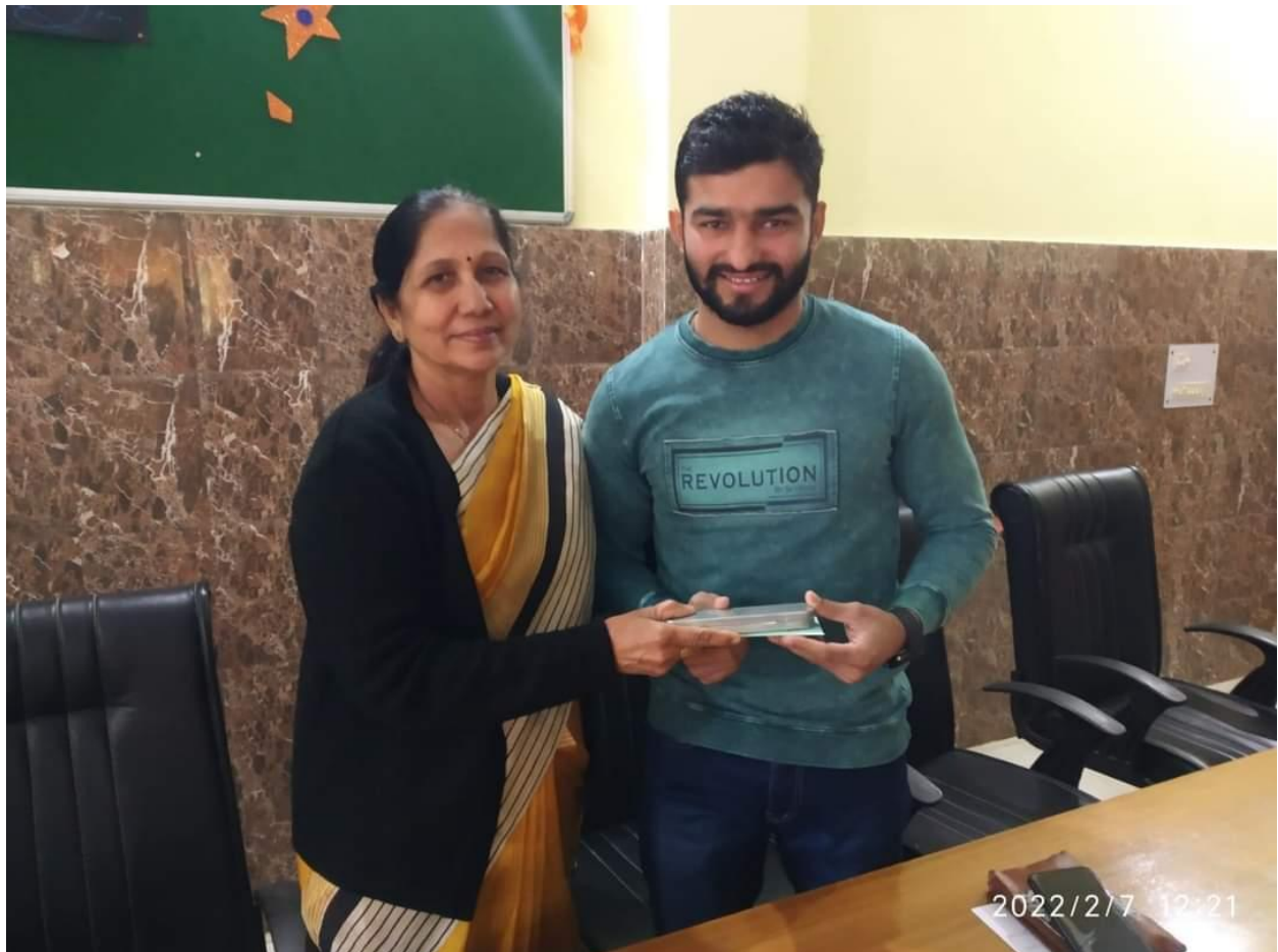
Principal felicitating the Mountaineer

Record is Entered in Asia Book of Records & India Book of Records