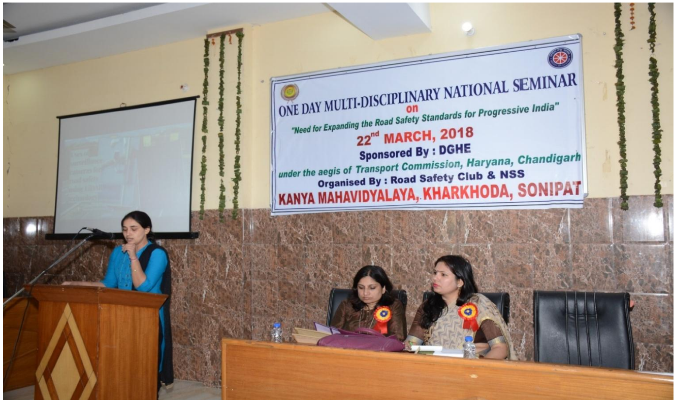
Student Participant Presenting the Paper