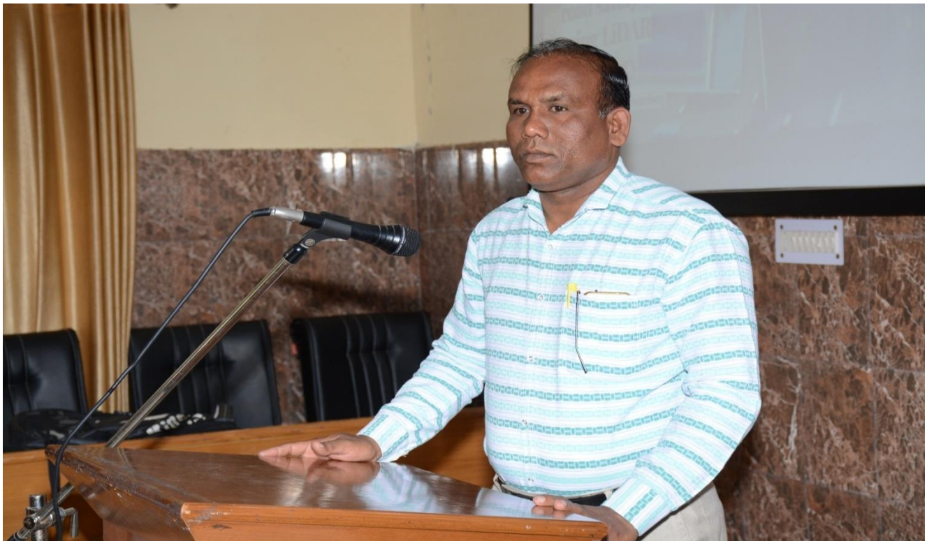
Delegates Presenting the Paper